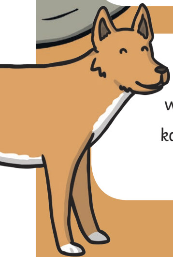
koala wombat kangaroo emu

w o p p o s s u m i u f b a u c x v x n m c d q i k e w h h f w k o g n l o m m r c i o g r r a d a u x s a s m u y n s i l k o o k a b u r r a n a l w a l l a b y a u g p r d m b i t t e r n o y k r k a n g a r o o i z y w k k n n t t e k u c d v v x t i q f j k v a n h p l a t y p u s