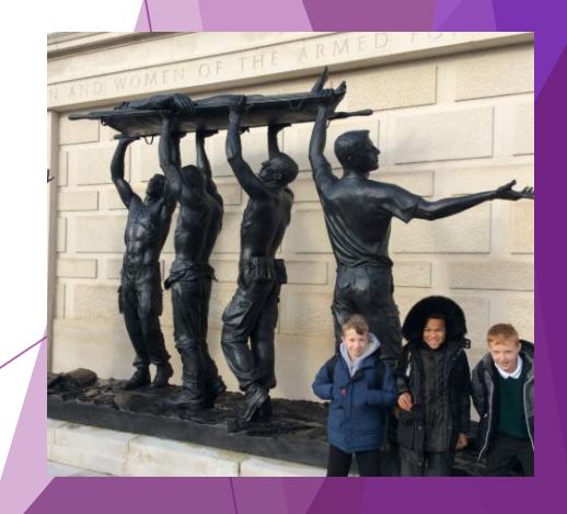
Year 6- National Memorial Arboretum