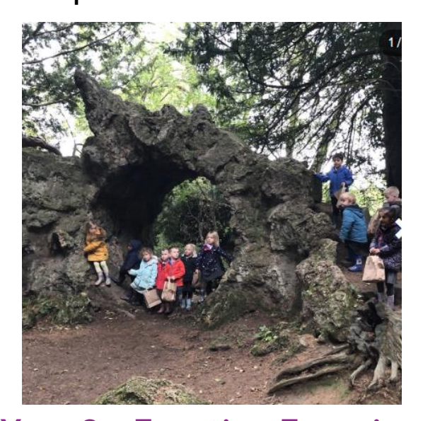
Year 1 - Sudbury Childhood Museum